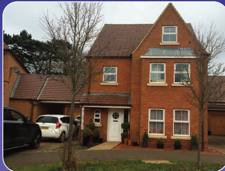
Kimwick Care Home

A Quality Care Provider to Adults With Mental Health and Learning Disabilities